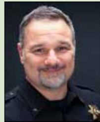
Police Chief Rob Wurpes

Of course, the best driving tip in bad weather is to not drive at all — stay home or take public transit. When it becomes necessary, SMART transit buses are