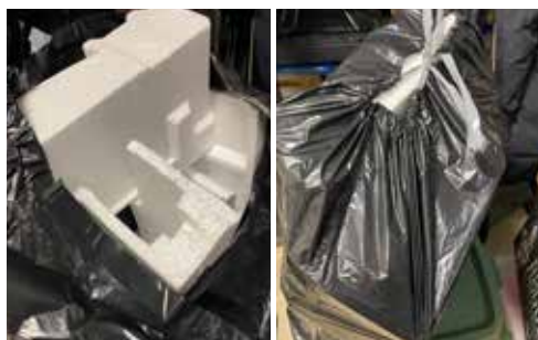
Polystyrene (hard foam) may be recycled at Wilsonville's transfer station, but must be bagged and secured.

Food Scrap Collection: Residential customers who have yard debris cart service may add kitchen food scraps to the cart. Learn more at ci.wilsonville.or.us/composting