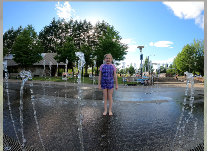
In The Vault