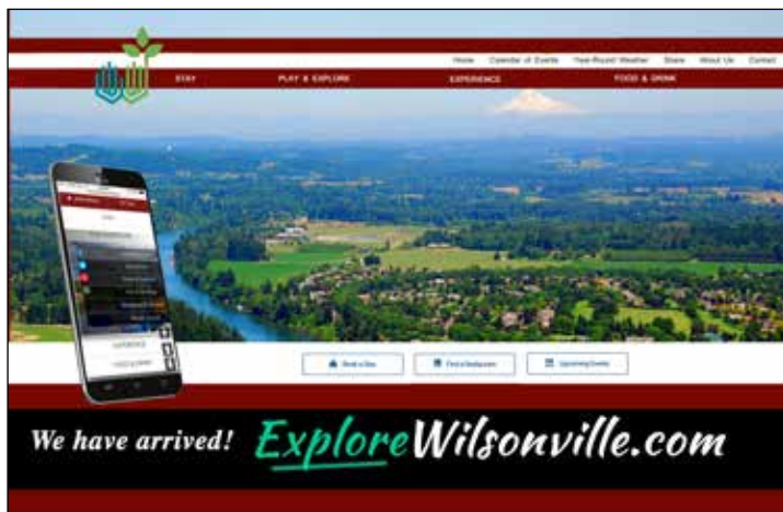
ExploreWilsonville.com is a new tourism promotion website.

As a community situated on the edge of two counties—Clackamas and Washington—and located near Marion and Yamhill counties, the tourism strategy suggested that a City tourism website would