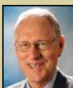
Tim Knapp Mayor

The City Council usually convenes on the first and third Monday of the month at City Hall, with work session generally starting at 5 pm and meeting at 7 pm. Meetings are broadcast live on Comcast/Xfinity Ch. 30 and Frontier Ch. 32 and are replayed periodically. Meetings are also available to stream live and by video-on-demand at www.ci.wilsonville.or.us/wilsonvilleTV . Public comment is welcome at City Council meetings.