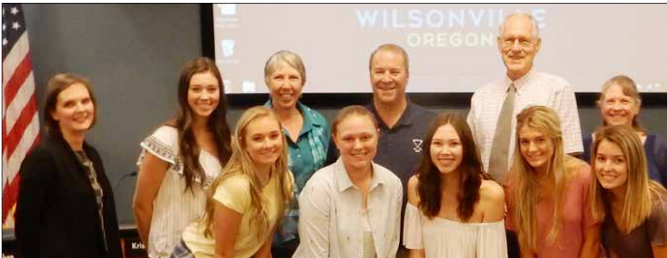
Members of the 2016-17 Wilsonville High School Varsity Girls Golf team and the Wilsonville City Council celebrating the High School's first ever 5A Girls Golf State championship, which the team won in May.