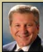
Scott Starr City Council President