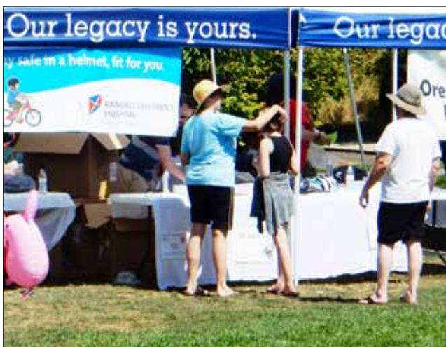
The Legacy Trauma Nurses and Oregon Trial Lawyers Association are providing kids free bike helmets at the fair.