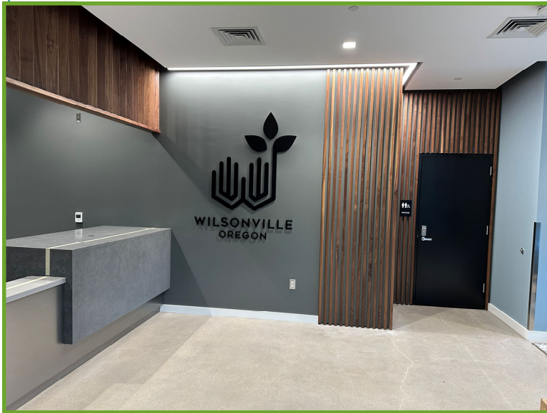
Photos clockwise starting left: administration building lobby; small conference room; and warehouse/yard.

Finishing touches and punch-list items were completed in January in preparation of Public Works staff moving to the new complex in February.