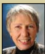
Charlotte Lehan City Councilor