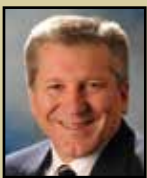
Scott Starr City Council President