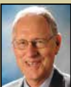
Tim Knapp Mayor

The City Council usually convenes on the first and third Monday of the month at City Hall, with work session generally starting at 5 pm and meeting at 7 pm. Meetings are broadcast live on Comcast/Xfinity Ch. 30 and Frontier Ch. 32 and are replayed periodically. Meetings are also available to stream live or on demand at www.ci.wilsonville.or.us/WilsonvilleTV . Public comment is welcome at City Council meetings.