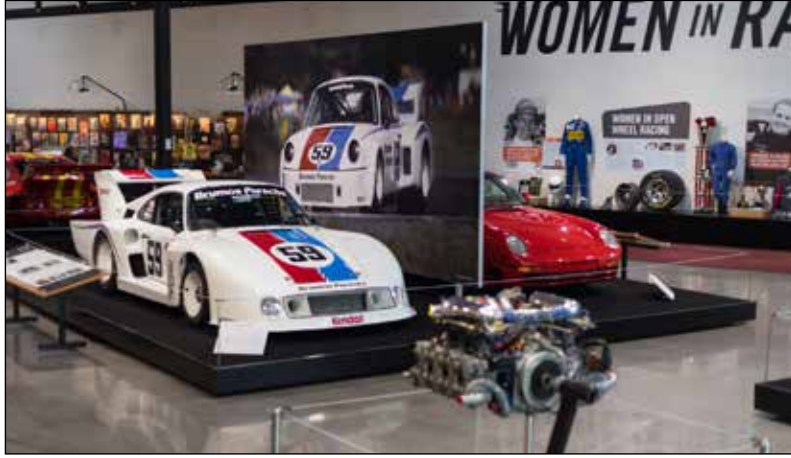
World of Speed Motorsports Museum is open Tuesday-Friday, 10 am-5 pm; Saturday, 9 am-5 pm; Sunday, 10 am-5 pm.

Over Veterans Day weekend, Wilsonville’s World of Speed Motorsports Museum is unveiling its new Harley-Davidson motorcycle exhibit, recognizing the iconic brand’s influence on American culture and its history with the U.S. military.