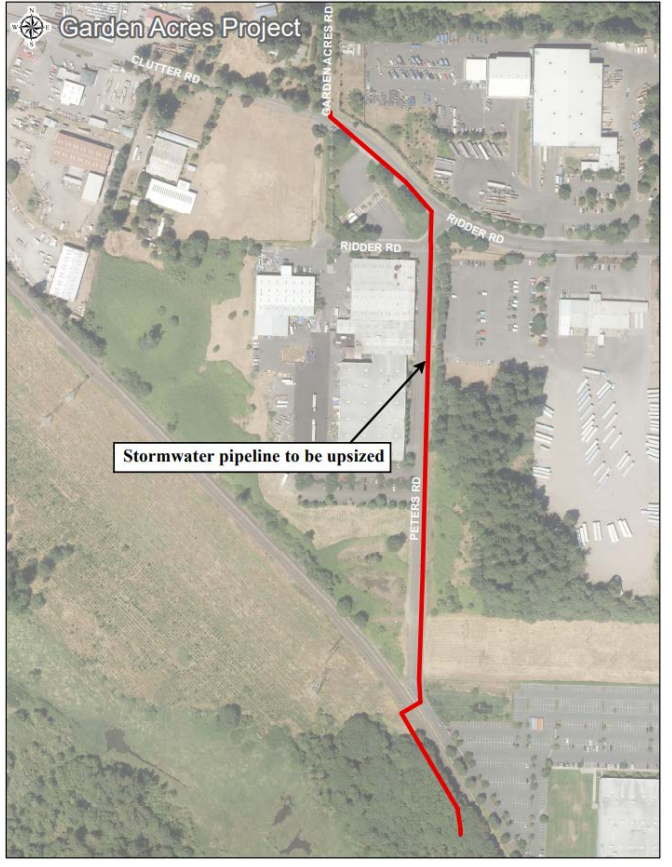
Figure 1: Stormwater Pipeline Upsizing

Identified as part of the Garden Acres roadway design, the existing stormwater pipelines serving the developed area in and around the Ridder Road and Garden Acres Road area need to be upsized to serve the build out of much of the Coffee Creek Industrial Area. This project funds construction of the stormwater pipeline along Ridder Road and Peters Road, approximately 2,400 feet of pipeline upsizing. The existing 18-inch stormline along Ridder Road will be replaced with a 42-inch stormline and will connect into the line running along Peters Road. The existing 24-inch stormline along Peters Road will be replaced with a new 48-inch stormline.