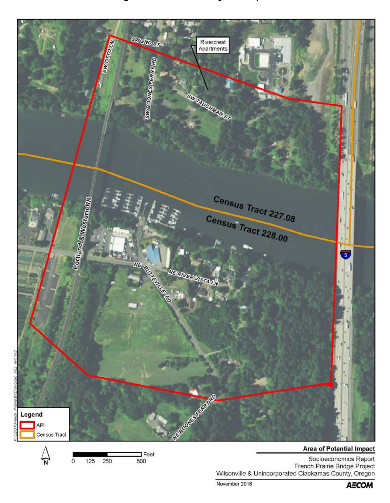
Figure 1. Area of Project Impact