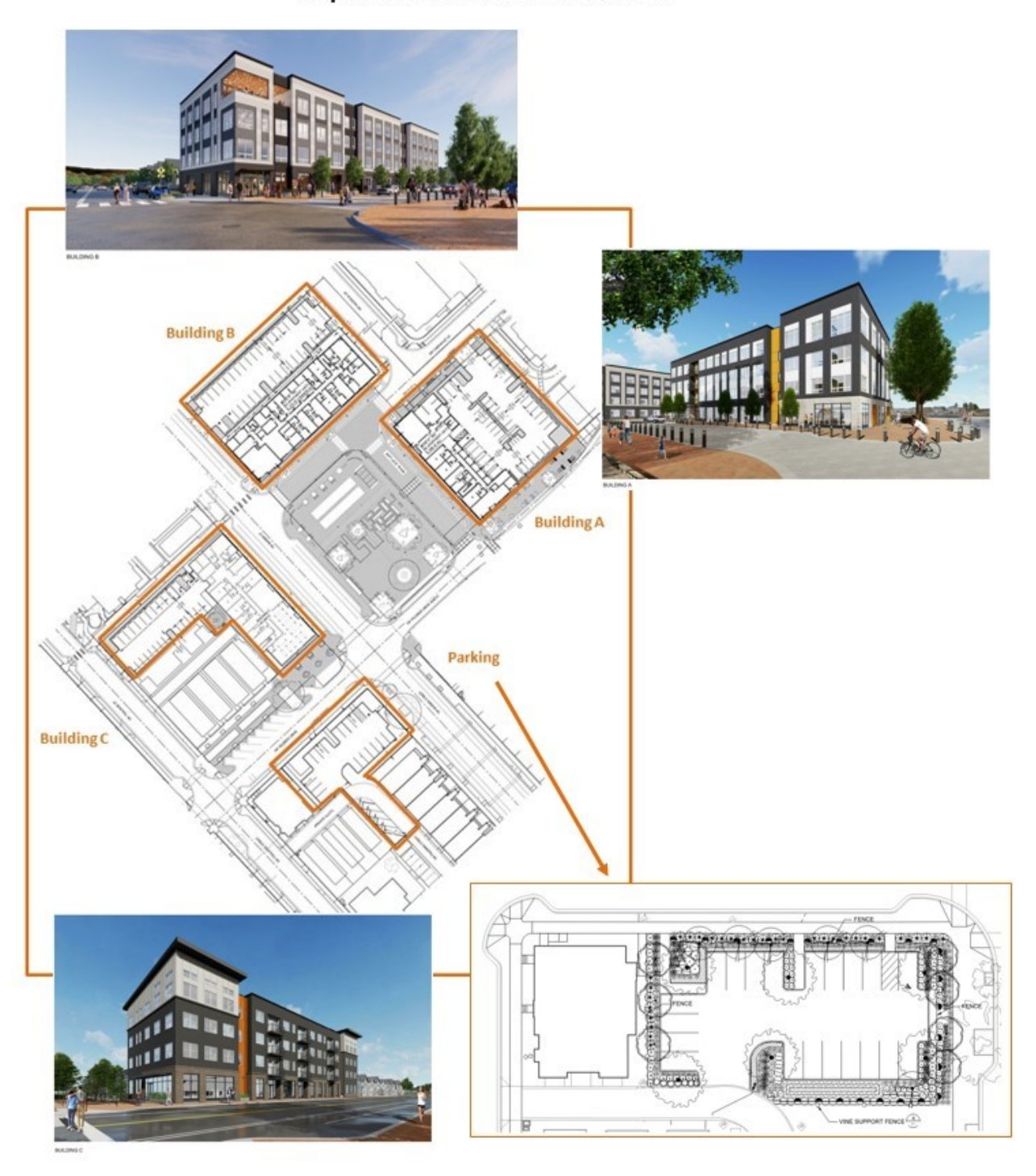
Proposed Site Plans and Illustrations