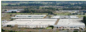
2 27255 SW 95th Ave URD