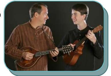
Indalo Wind performs Sat., May 13

Friday, May 5 6:00–8:00 pm Oak Room No charge