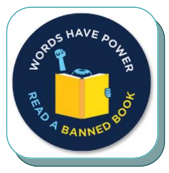
Find out more on the library website:

Learn about books that have been removed or challenged in schools and libraries in the United States every year. Some you might agree with, and others will surprise you.