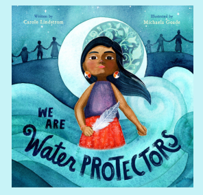
We Are Water Protectors

From the cresting of a wave to a snake shedding its skin, this charmingly illustrated text reminds us to slow down and notice the beauty of nature. Rainbows, snowflakes, sunsets, and so much more beauty is there for us if we pause and pay attention.