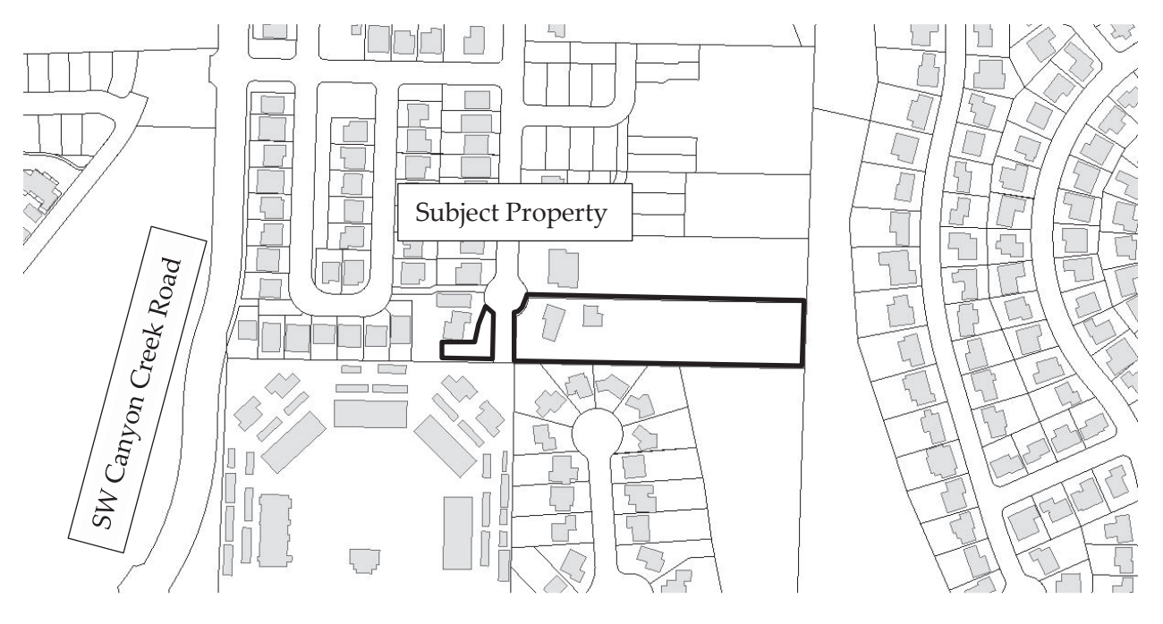
Zone Map Amendment (DB20-0039)

Contingent on approval of the Comprehensive Plan Map Amendment for an increased density of 4-5 du/ac, the applicant proposes a corresponding PDR zoning of PDR-3. Other portions of Bridle Trail Ranchetts with past approval of increased density to 4-5 du/ac have the same PDR-3 zoning.