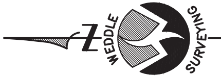
EXHIBIT 'B' CITY ANNEXATION IN THE S.W. 1/4 AND THE N.W. 1/4 SECTION 2, T.3S., R.1W., W.M. WASHINGTON COUNTY, OREGON