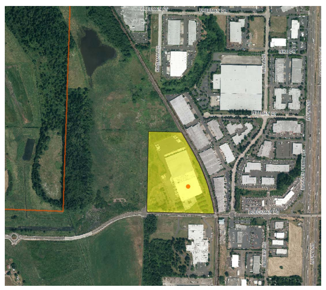
Figure 1 – 9805 SW Boeckman Road Urban Renewal Plan Area Boundary