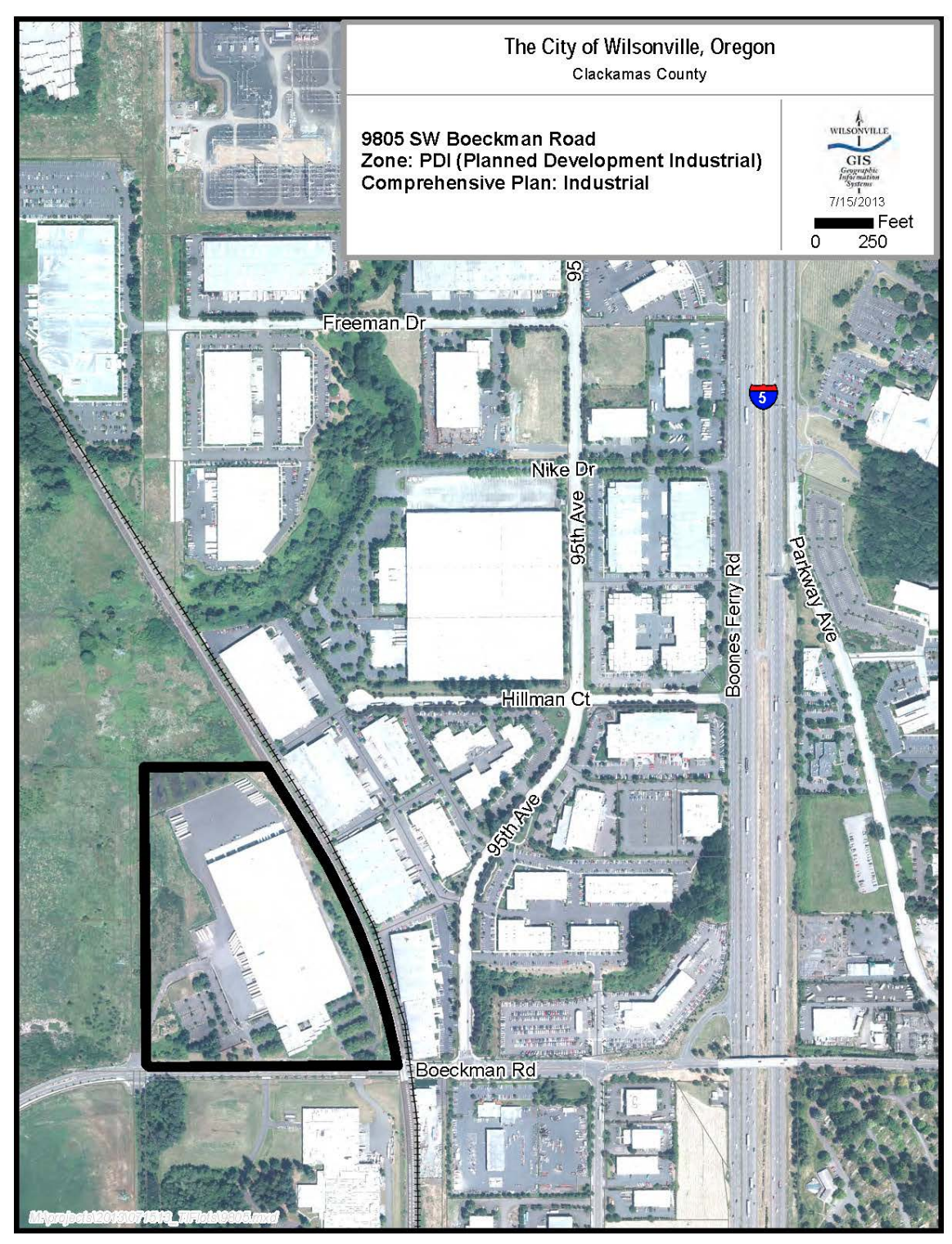
Figure 2 – Area Zoning and Comprehensive Plan Designations