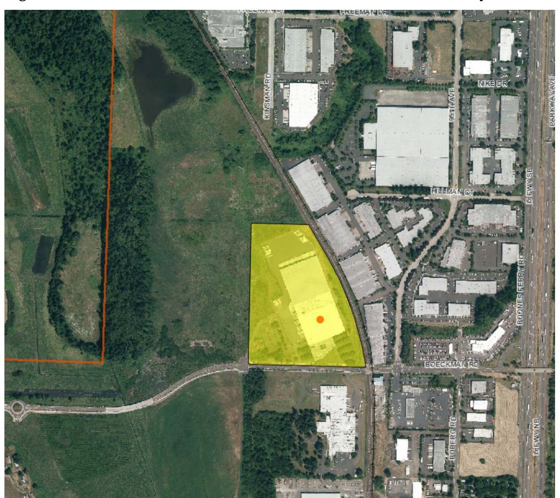
Figure 1 – 9805 SW Boeckman Road Urban Renewal Area Boundary