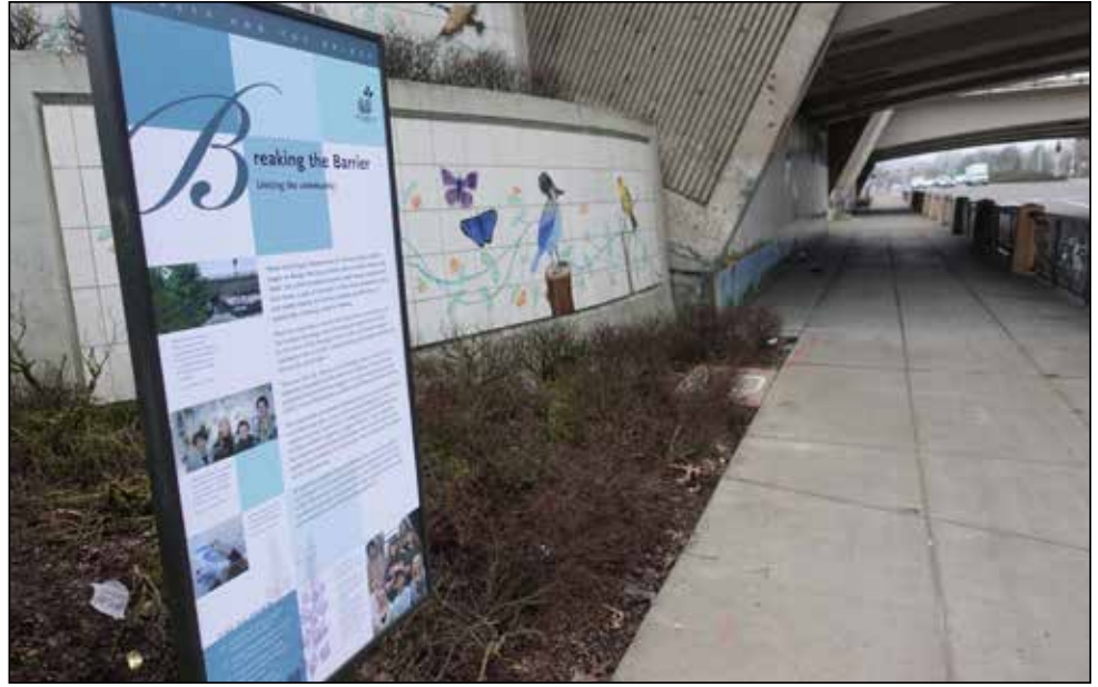
The addition of “Beauty and the Bridge” interpretive signage at the I-5 Underpass was one recent project funded by the Wilsonville-Metro Community Enhancement Program.

Those who are interested in nominating projects will have multiple opportunities to discuss prospective applications with staff during virtual information sessions to be scheduled with program administrators.