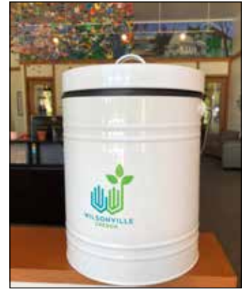
The City is giving away 500 free kitchen compost buckets to encourage food scrap recycling.

Kitchen compost buckets make it easy to collect food scraps for composting. Collect food scraps in your bucket and — when your bucket is full — deposit your scraps in your green Republic Services yard debris bin for weekly removal.