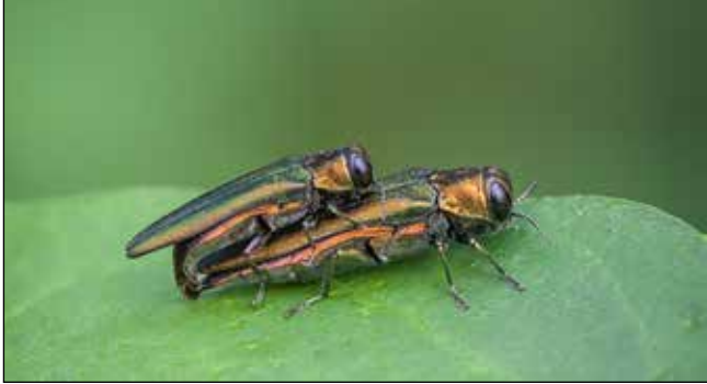
Smaller than a penny, the destructive emerald ash borer (EAB) likely arrived in the U.S. via shipping crates in 2002. The pest was first discovered in Oregon last year.

Arborists everywhere are taking proactive aim at a new foe that is destined to substantially alter the world's treescape.