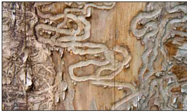
The distinctive marks left by feeding larvae are a tell-tale sign of emerald ash borer infestation.