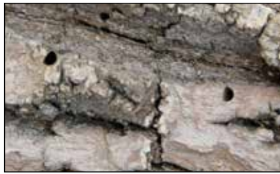
Distinctive D-shaped exit holes are one indicator of EAB infestation.

EAB can take a few years to kill a tree. Infested trees that appear healthy may decline rapidly as the insect population builds exponentially. While adult EAB are poor flyers, studies have shown that mated females can fly an average distance of nearly 2 miles.