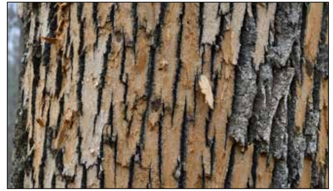
Woodpeckers enjoy feeding on EAB larvae, so bark stripped bare by the birds can also be a sign of infestation.

come hazardous. Removal and replacement plans help distribute costs over time.