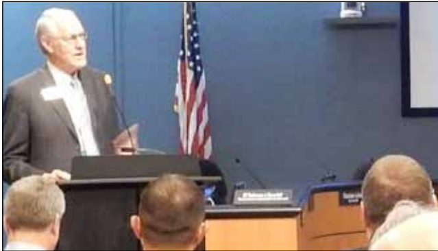
Mayor Tim Knapp delivering the 2016 ‘State of the City’ Address at the March 7 City Council meeting.

The Wilsonville City Council held a first reading, public hearing and then approved a pair of related ordinances for an annexation and a Zone Map amendment of a 1.0-acre parcel, located at 11700 SW Tooze Road. The Council also rezoned the parcel from Rural