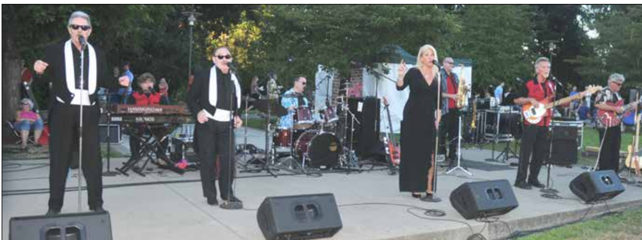
The City's Tourism Grant Program supports the Rotary Club's Summer Concert Series, which brings popular bands like Johnny Limbo and the Lugnuts, that draws large crowds to Town Center Park in late July and early August.