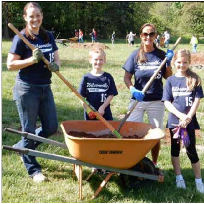
WERK Day volunteers fixing up Memorial Park in 2015.