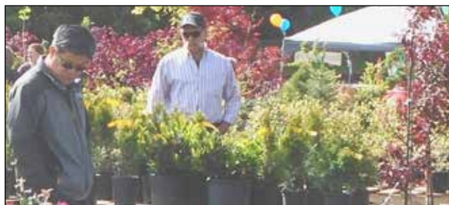
Shoppers at last year's Rite Aid Annual Plant Sale.

nated by local nurseries. Proceeds from the sales and rentals are donated to the Children's Miracle Network Hospitals.