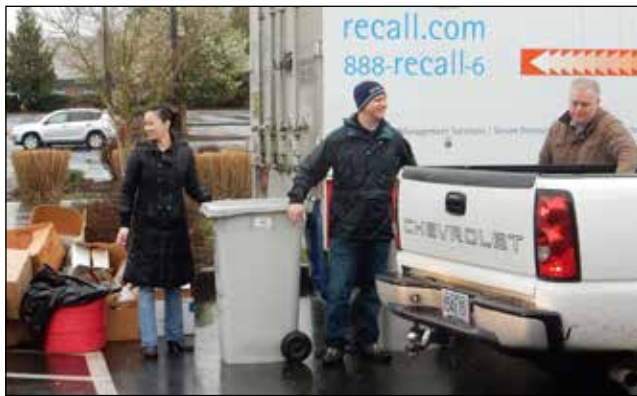
US Bank staff greet customers and help unload documents.

participating community members are encouraged to make a financial contribution to a Wood Middle School program that teaches seventh graders about leadership and community involvement.