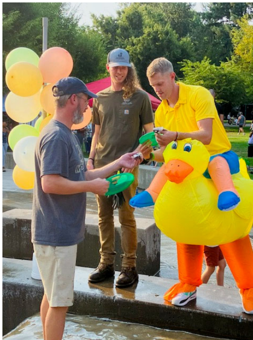
Party in the Park Support