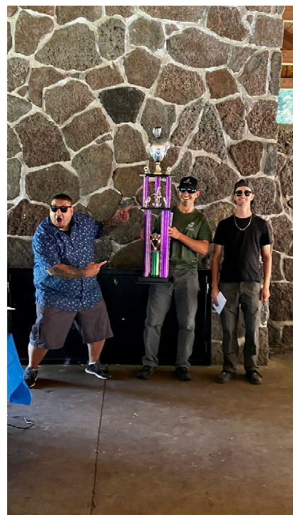
Disc Golf Tournament Winners