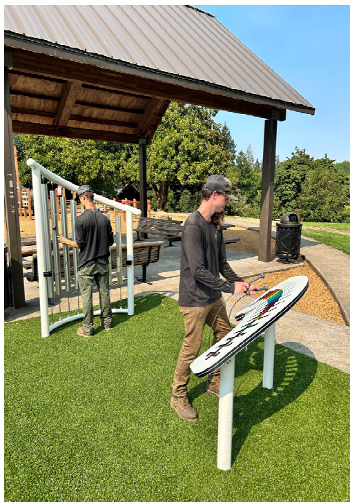
Murase Play Equipment