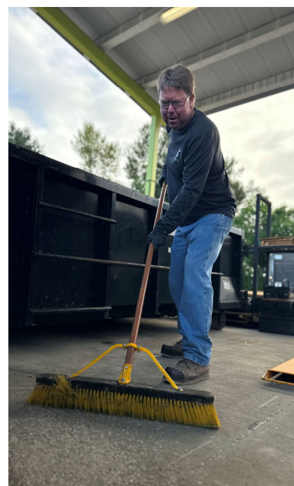
Routine Equipment Cleaning