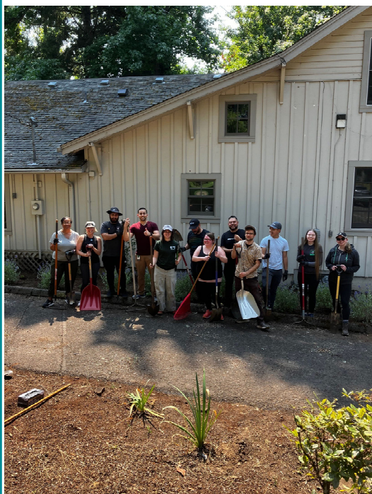
Twist Bioscience Volunteer Day At the Tauchman House