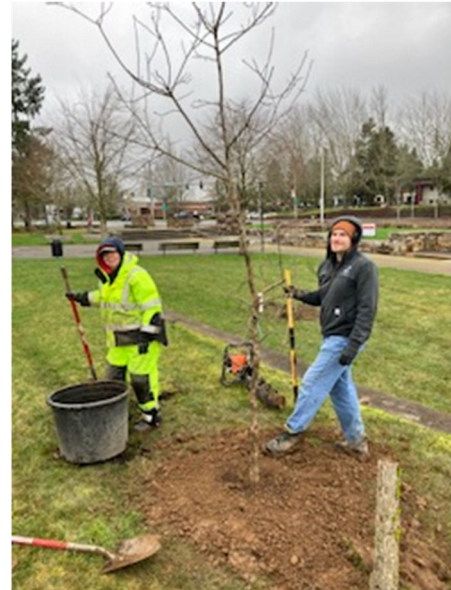
Tree Planting at Murase