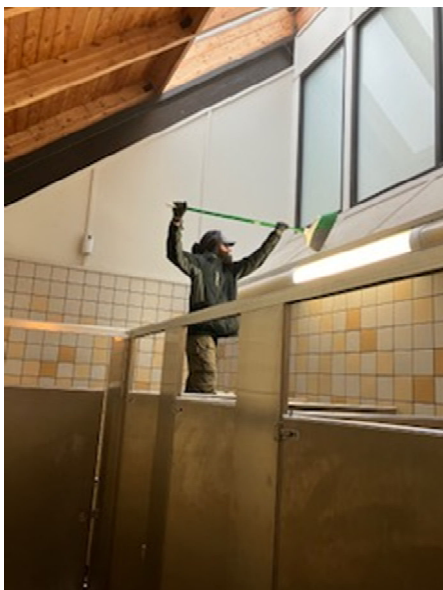
Restroom Deep Clean