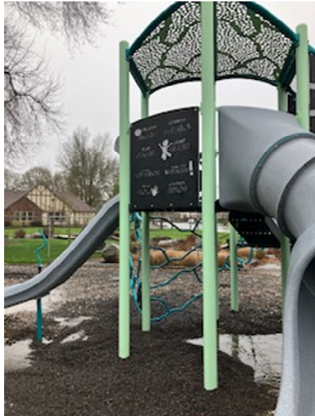
Sofia Nearing Completion

As spring continues to draw near, the Parks team kept busy in February with both small projects and maintenance. Sofia Park's playground is nearing completion and should reopen in March. The Team spent time planting new trees and installing irrigation to better steward parks system wide. They also spent time deep cleaning restrooms in anticipation of a busy summer. Murase will be getting nine new picnic tables to replace aging tables, some of which were not originally ADA. The team assembled those tables this month and they are excited to get them out when the weather allows.