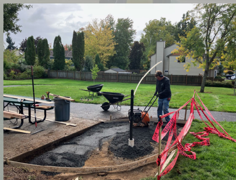
ADA Fountain Prep