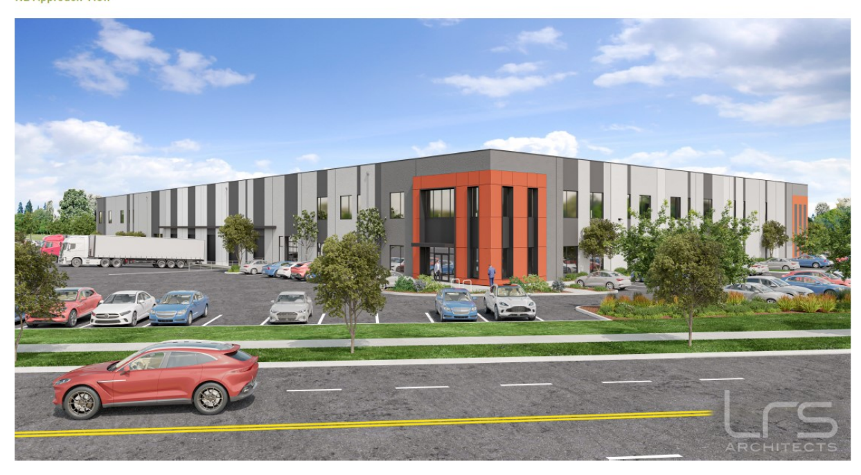
ELEVATION DESIGN NW Approach View