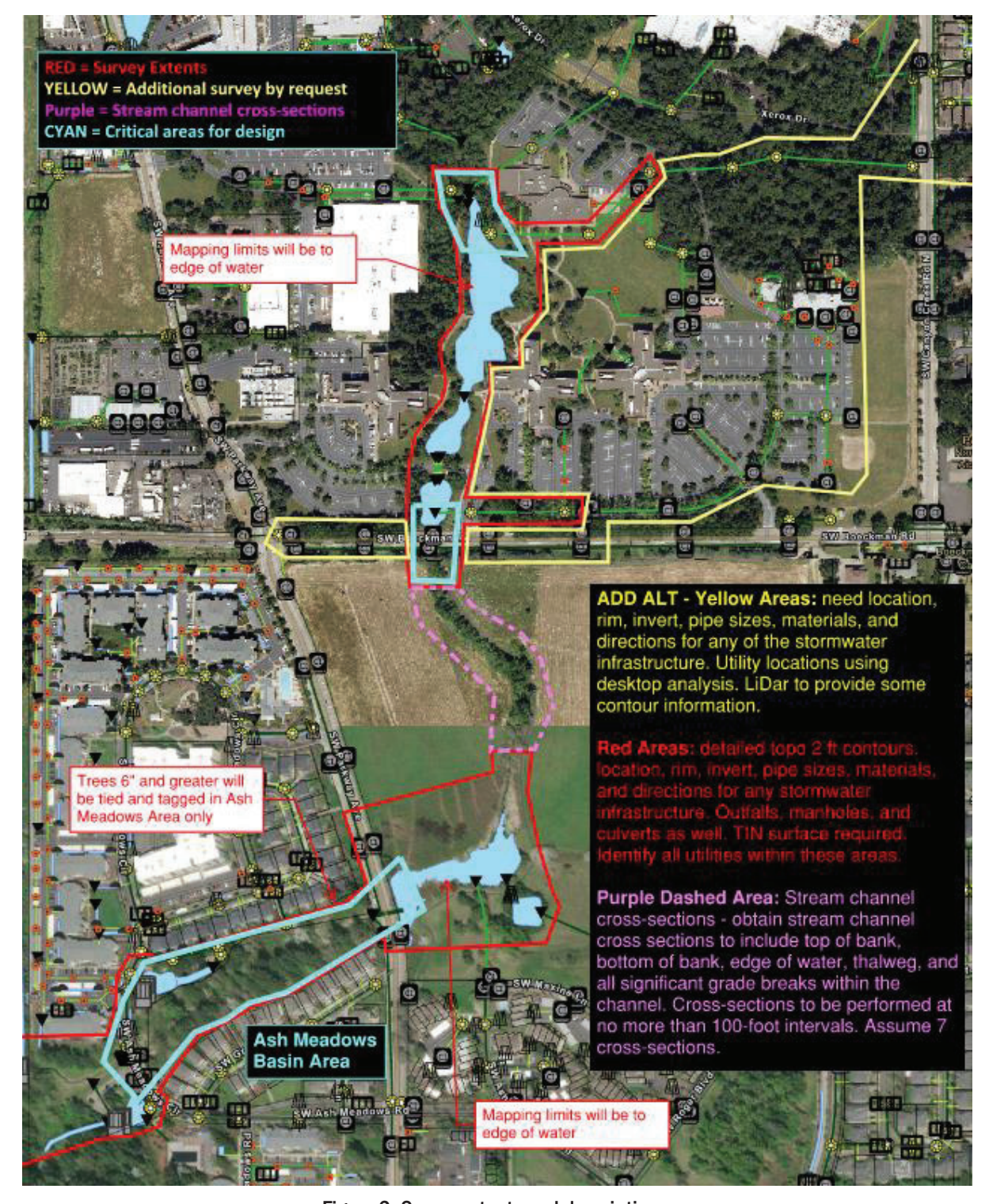
Figure 2. Survey extents and descriptions