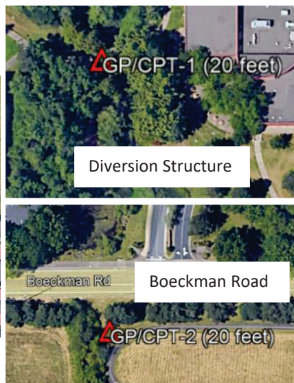
Figure 3. Geotechnical field exploration locations

Geotechnical and hazardous materials assessment services will include: