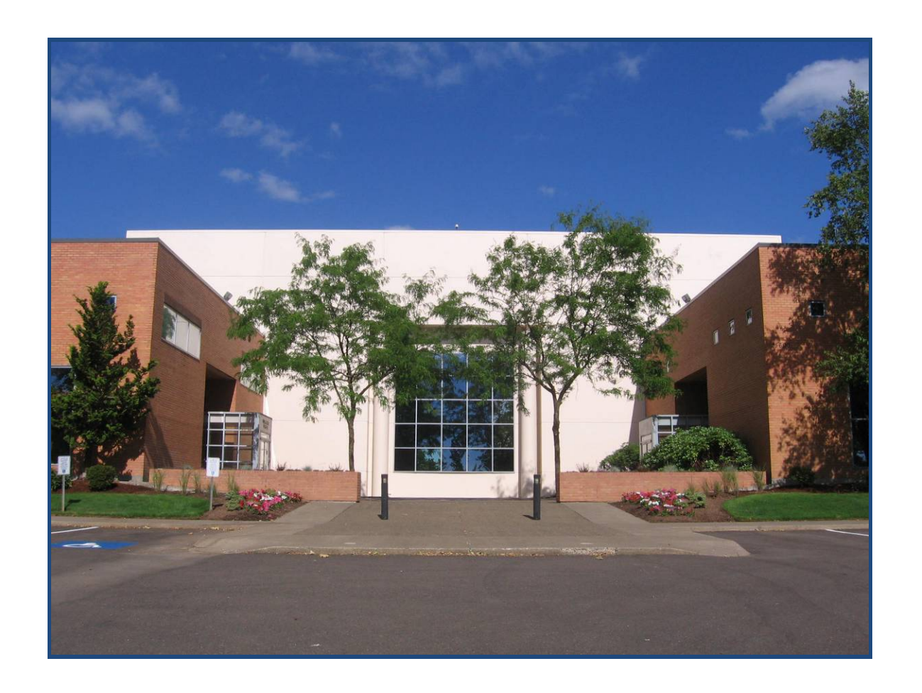
Prepared for the City of Wilsonville November 4, 2013