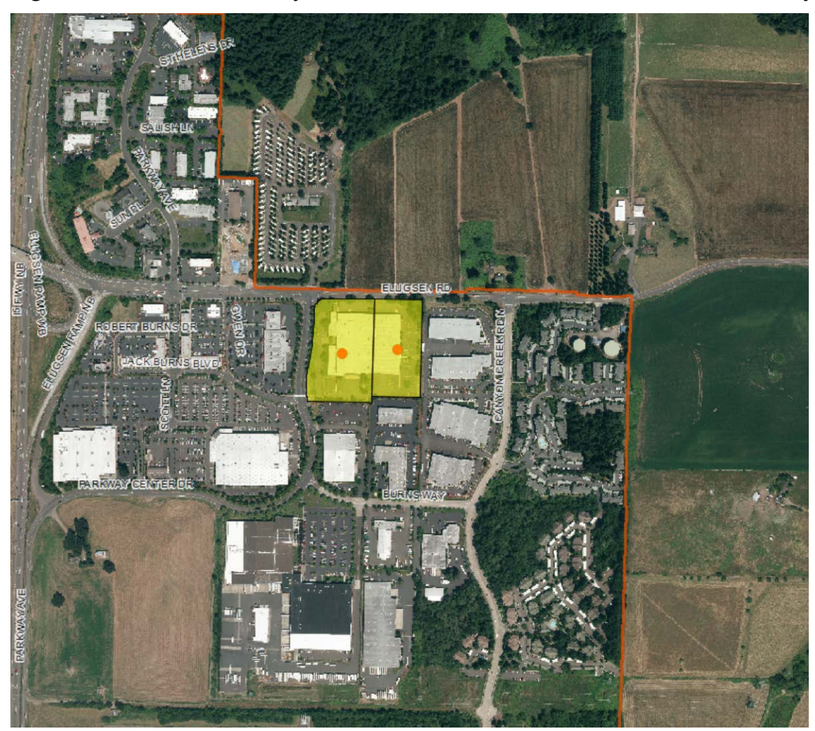
Figure 1 – 25600 SW Parkway Center Drive Urban Renewal Plan Area Boundary