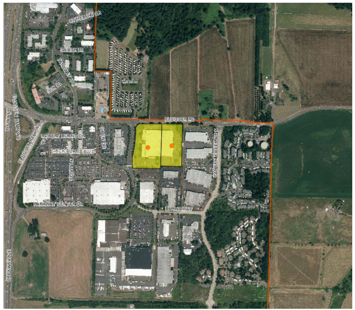
Figure 1 – 25600 SW Parkway Center Drive Urban Renewal Area Boundary