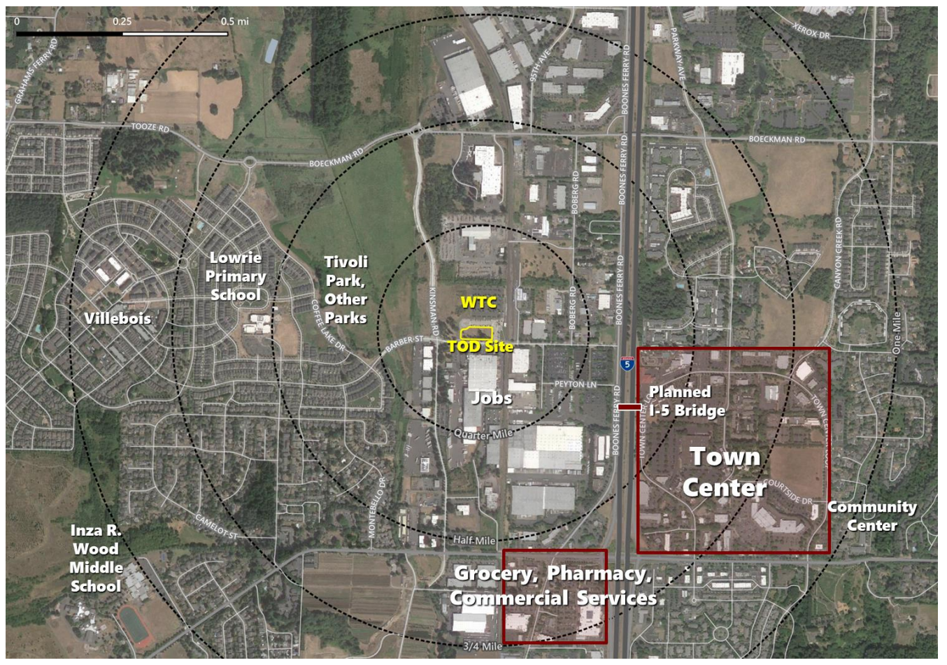
Figure 2. Location and Context