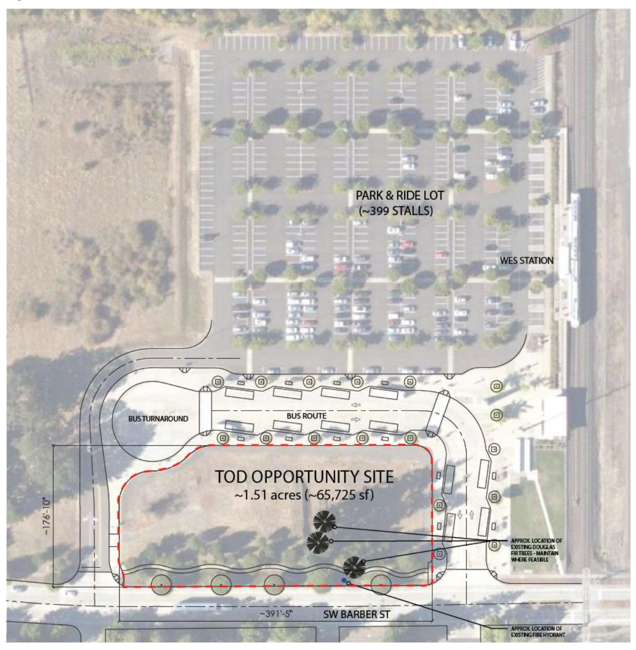
Figure 1. Site Overview

The TOD Site is shown in Figure 1 below. This section of the RFQ summarizes attributes of the TOD Site and surrounding area; additional information about the site and area is included in the Existing Conditions and Context Summary report—see the Appendices for more information. The TOD Site has been designated as a "future development parcel" since the entire Transit Center (including WES Station, bus facilities, and park and ride shown below) was planned and permitted between 2006 and 2008.